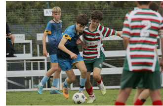
Knockout Cup Final: U13s v Westlake Boys High