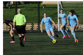
APC Final: Football Girls 1st XI v Baradene College