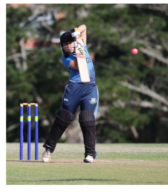
Sports registrations for Term 4 Click here