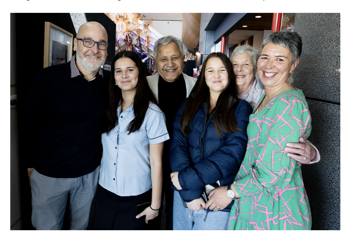
Theatresports players third in finals

This year's exhibition focuses on Toi Māori and Pacific Arts at Excellence level. Participants were also invited to attend workshops at Te Papa run by recognised Māori Artists and given a 'behind the scenes' tour of Te Papa.