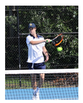
Sports registrations for Term 4 Click <u>here</u>