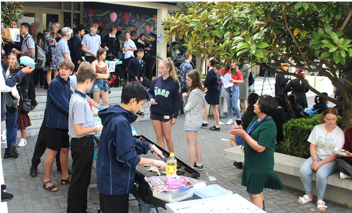
The Pohutukawa Tree