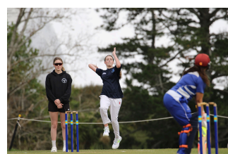
Junior Girls Cricket v St