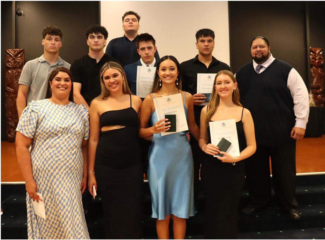
Arts Awards Dinner