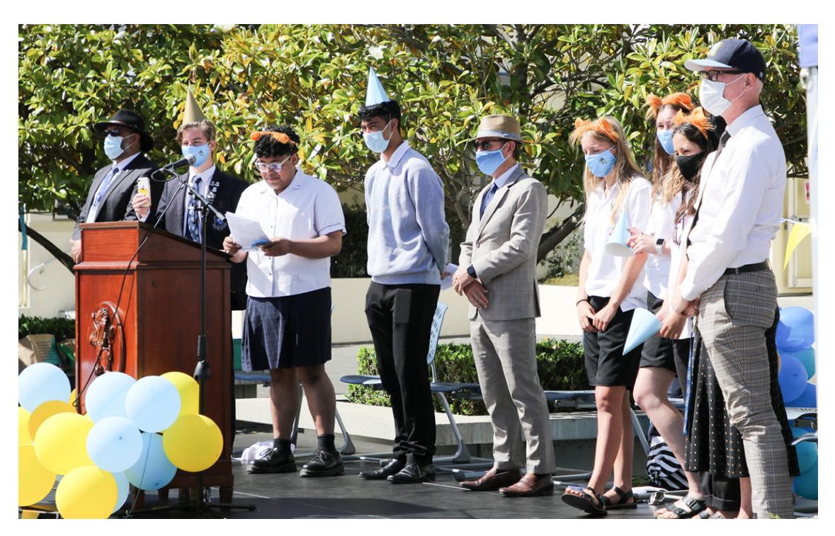
Sports Awards 2021