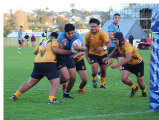
Rugby League 1st XIII v Manurewa College, click here