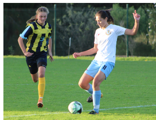
Football Girls 1st XI v Takapuna Grammar, click here