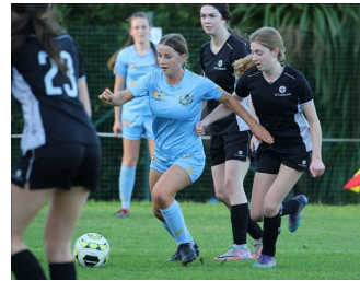
Football Girls 1st XI v St Cuthbert's Click here