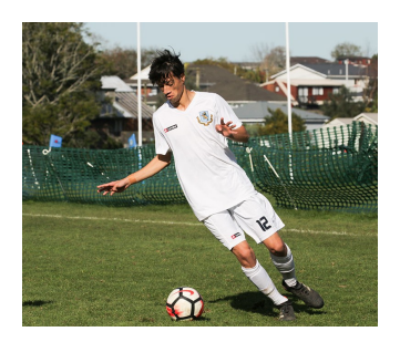
Winter Sport trials and registrations Click here