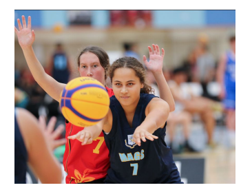
Basketball 3x3 Tournament Click here