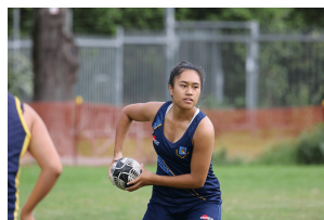
Photo Essays Touch Premier Girls v AGGS Click here