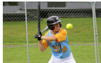
Senior Boys Softball Click here