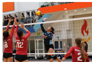
AKSS Volleyball: Senior Girls Click here