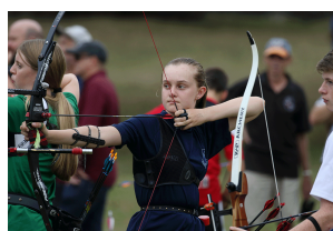
Photo Essays Auckland League Archery Click here