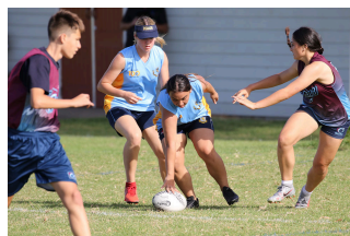
Touch Premier Mixed v Botany Downs Click here