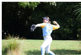
Softball Senior Girls v Avondale College Click here