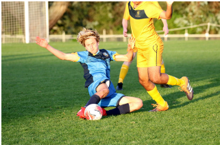
Football Boys 1st XI v