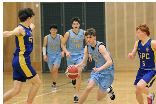
Basketball Premier Boys v St Paul's Click here