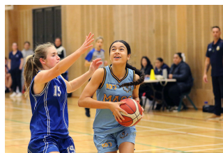
Basketball Premier Girls v St Kentigern Click here