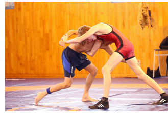
AKSS Wrestling Click here