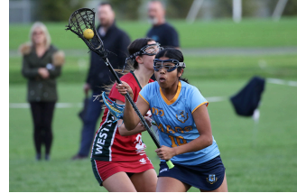
Lacrosse Premier Girls v Westlake Girls High Click here

Our Lion Fund programme aims to provide financial support to allow every MAGS student to access the breadth of opportunities we offer at our school.