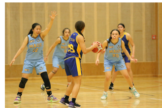
Basketball Premier Girls v Epsom Girls Grammar Click here