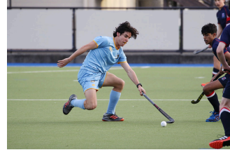
Hockey Boys 1st XI v Macleans College Click here

Our Lion Fund programme aims to provide financial support to allow every MAGS student to access the breadth of opportunities we offer at our school.