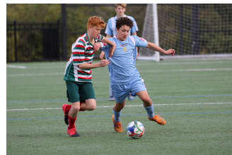
Football Boys U15