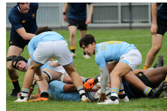
Rugby Boys 1st XV v Auckland Grammar Click here