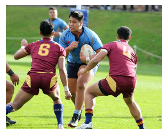
Rugby League 1st XIII v St Paul's College