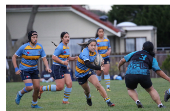
Rugby Girls 1st XV v Southern Cross Campus