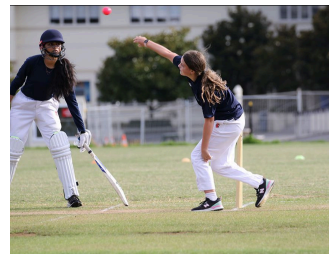
Cricket Girls 2nd XI v EGGS