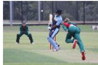
Cricket Boys 1st XI v Westlake Boys Click here