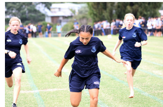
MAGS Athletics Championships Click here