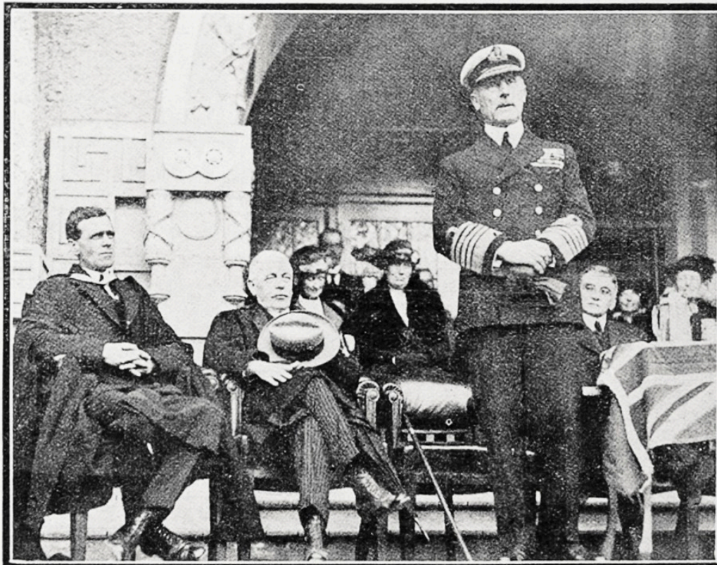
THE GOVERNOR-GENERAL, LORD JELlicoe FORMALLY OPENING THE MOUNT ALBERT GRAMMAR SCHOOL AT AUCKLAND LAST WEEK.

As we get closer to our Centenary in 2022, we warmly invite all Albertians to sign up to the database here to keep up to date with information, communications and events leading up to the Centenary celebration.