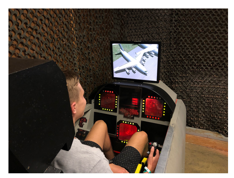
and dinner at the iconic Hard Rock Cafe. For a full report and more photos, click <u>here</u>