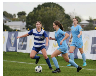
Football Girls 1st XI v St Kentigern Click here