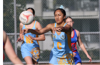
Netball Combined Points Tournament Premiers – click here Year 10s – click here Year 9s – click here Boys – click here