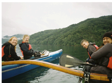
Outward Bound Adapted Courses