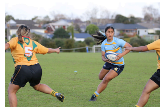
Rugby Girls 1st XV v Manurewa College Click here