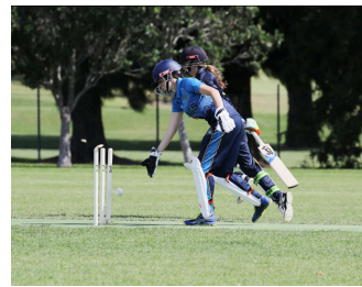
Cricket Girls 1st XI v Takapuna Grammar Click here