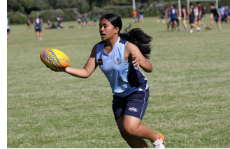
Junior Girls Touch