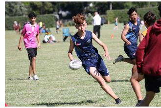
Junior Boys Touch