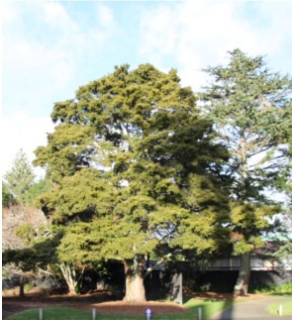
A close-up of the trunk shows a distinct bifurcation.